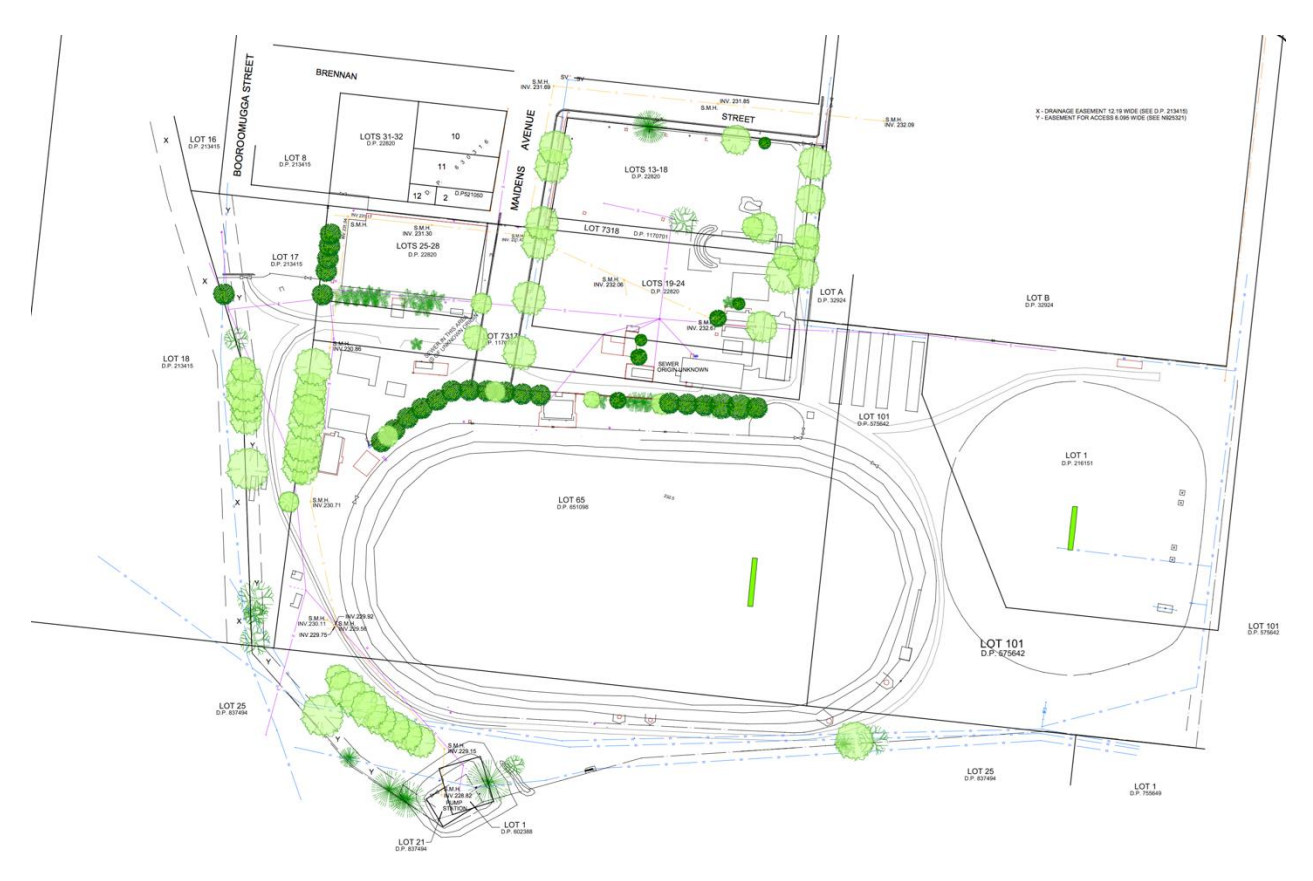
Figure 1: The lots comprising Ward Oval one of Cobar's premier sporting facilities.

The subject site is comprised of a number of allotments owned by either the Cobar Shire Council (Council) or the NSW State Government (Crown). These allotments are Lots 13-28 in D.P. 22820 and Lots 7317-7318 in D.P. 1170701 and Lot 1 in D.P. 216151 and Lot 17 in D.P. 213415 and Lot 65 in D.P. 651098 and Lot 1 in D.P. 602398 and Lot 21 in D.P. 837494 in Ward Oval, Cobar and shown in Figure 1.