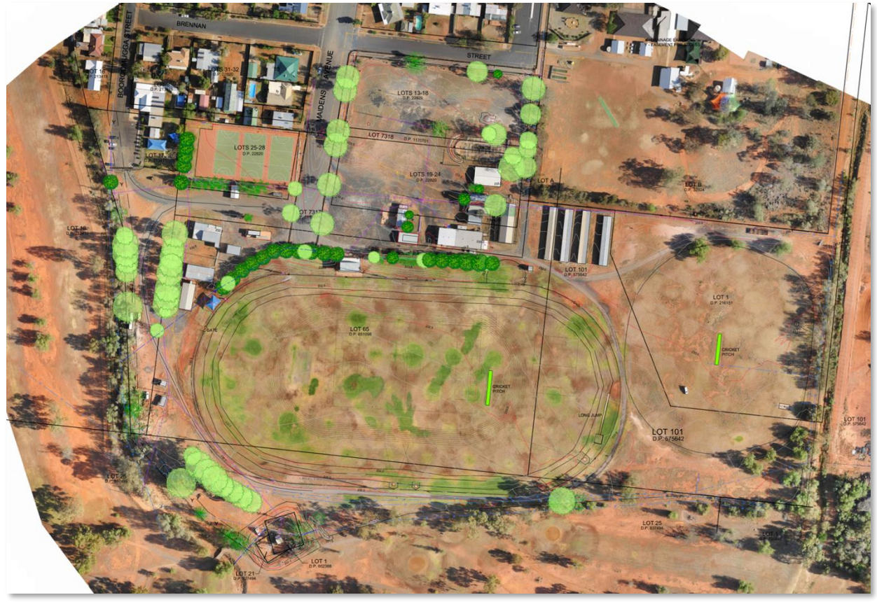
Figure 3: Ward Oval comprises of a number of facilities with a main multipurpose oval central to the site.

Council has developed a Master Plan for Ward Oval which includes concept designs for a new multi-purpose centre, Early Learning precinct, upgrades to the oval including athletic facilities, additional lighting, improved show facilities and landscaping.